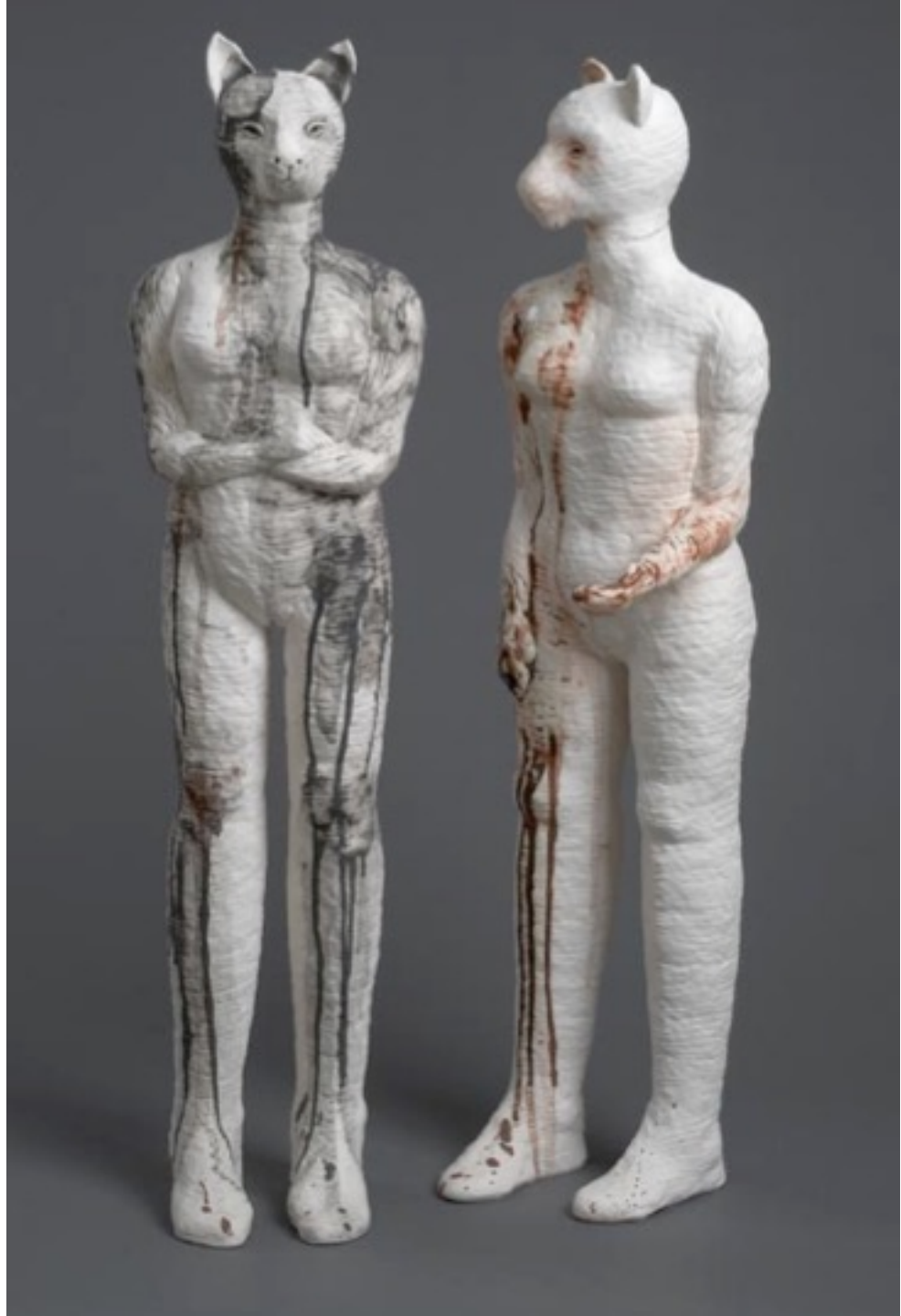
Cat Woman with Folded Arms and Lioness, 2008, ceramic, Christie Brown